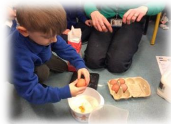
Pancake Day celebrated in Deene Class