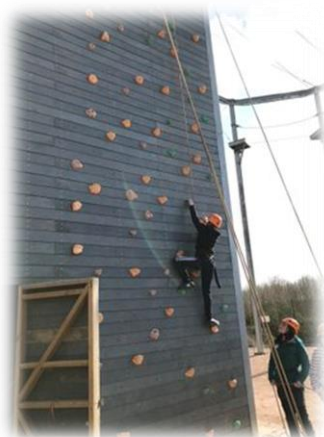
Fun at the Frontier Centre for Rockingham

Thank you for your support as always. I wish you a happy weekend!